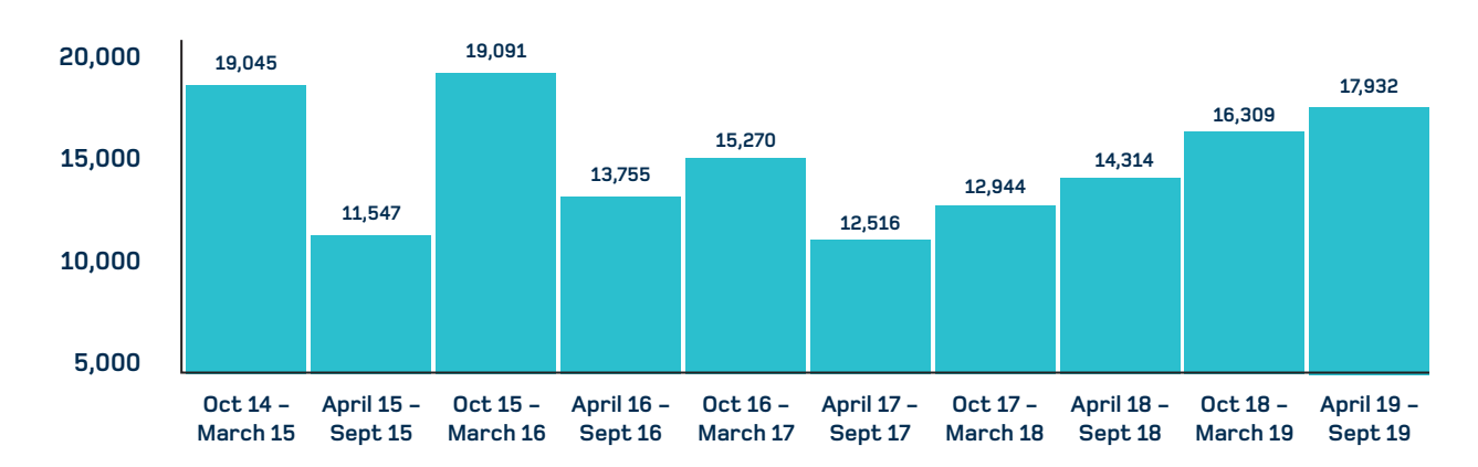
Figure 3 Number of nurses, midwives and nursing associates* leaving the UK register