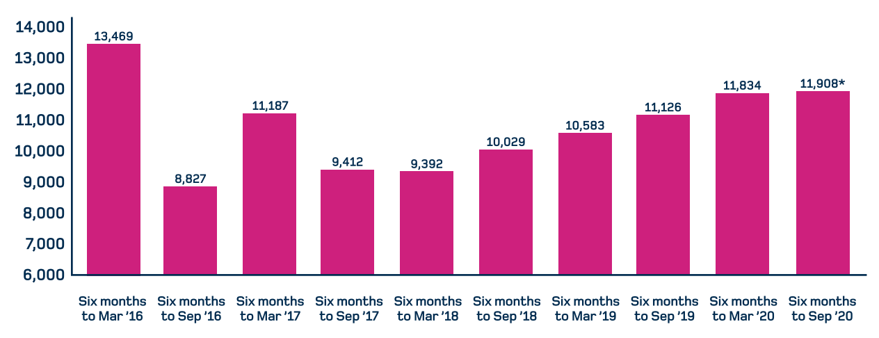
* Of the 11,908 joiners in England in the six months to September 2020, 1,832 had been on the Covid-19 temporary register.