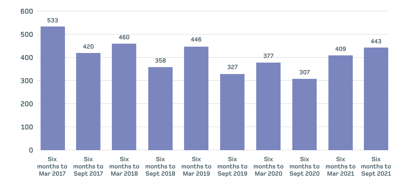
Figure 3 Number of people leaving the permanent register with an address in Northern Ireland.

The data in this report is based on the registered addresses of the professionals on our register.